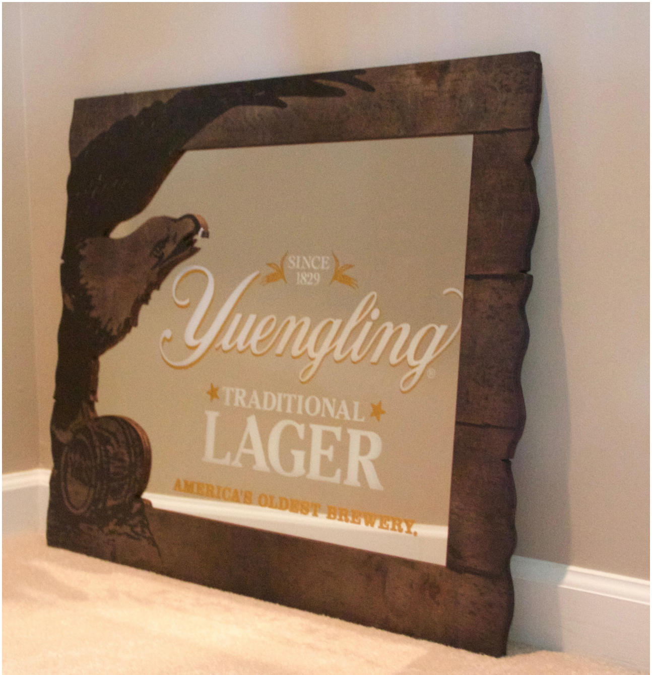
New Yuengling Beer mirror sign in wooden frame, still in box. Value: $75 Opening bid: $15